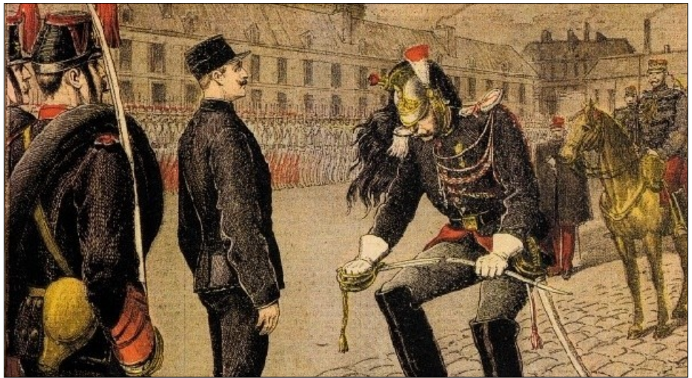
IMAGE: This drawing, which appeared on the front page of the Sunday supplement to Le Petit Journal (13 January 1895) with the caption, "The Traitor: The Degradation of Alfred Dreyfus," depicts the French Jewish artillery officer's public demotion after having been falsely convicted of treason on 5 January 1895. Was Dreyfus's fate symbolic of the Jewish experience as a stigmatized minority in the modern nation-state?

Topics include religious revival, Reform, Enlightenment, integration and discrimination, political antisemitism, Zionism, the Holocaust, and the State of Israel.